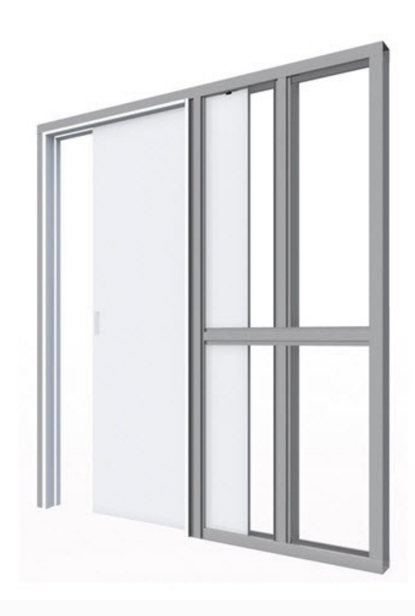
Building systems and Liune pocket doors